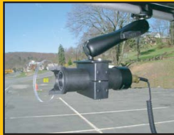
Optical Guidance System