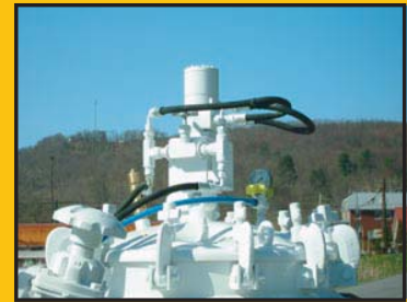
Hydraulic Paint Agitation