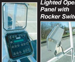
Weather Proof w/Tilt Feature

Lighted Operator Panel with Rocker Switches