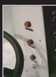
Push Button Gun Flushing

Lighted Operator Panel with Rocker Switches