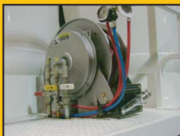
Dual Color Hand Spray