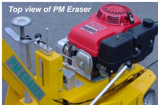
Top view of PM Eraser